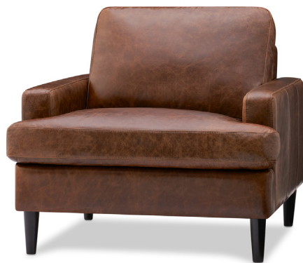
Leather Armchair - Jasper Walnut

COMPLIMENTARY ASSEMBLY OF PRODUCT AVAILABLE BEFORE DELIVERY OR PICK UP UPON REQUEST