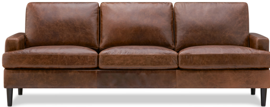
Leather Sofa - Jasper Walnut

COMPLIMENTARY ASSEMBLY OF PRODUCT AVAILABLE BEFORE DELIVERY OR PICK UP UPON REQUEST