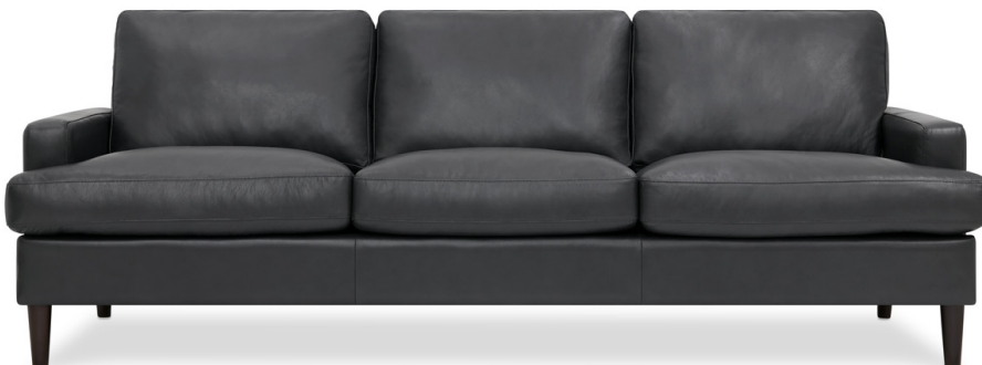
Leather Sofa - Jett Anthracite