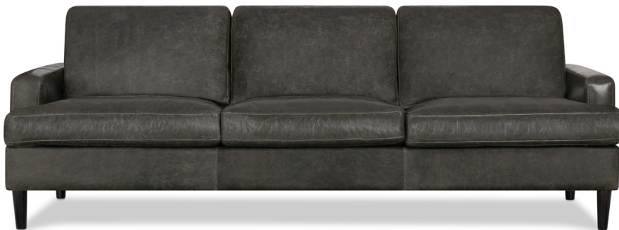
Leather Sofa - Jasper Graphite