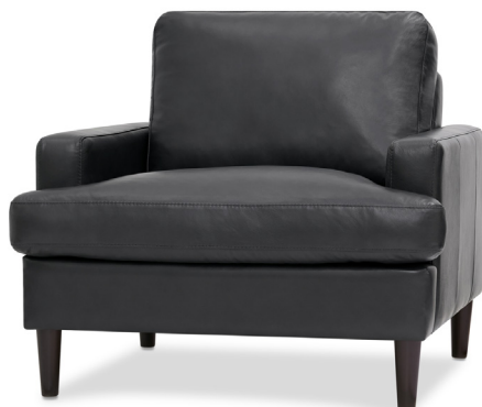
Leather Armchair - Jett Anthracite