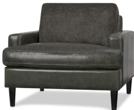
Leather Armchair - Jasper Graphite