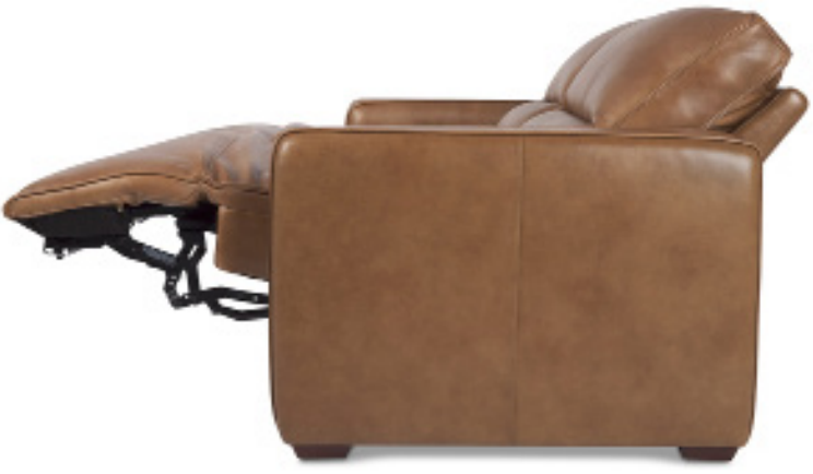
Leather Reclining Sofa