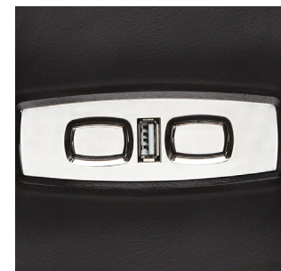
Motion switch and USB port