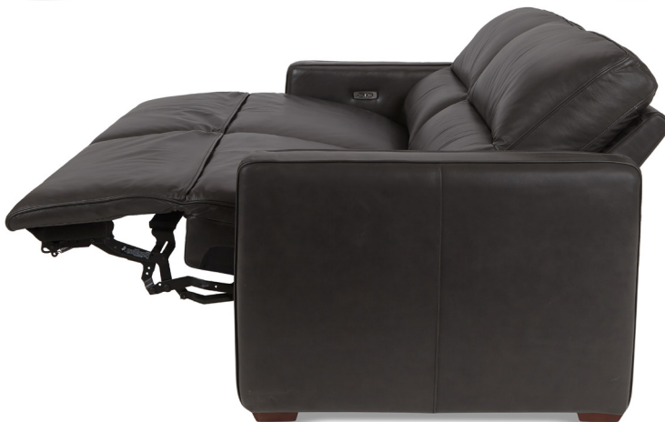
Leather Reclining Sofa