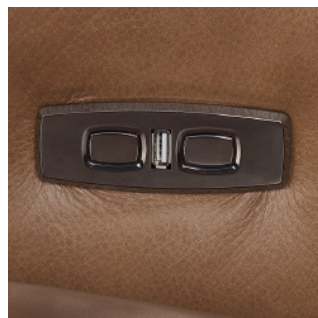
Motion switch and USB port