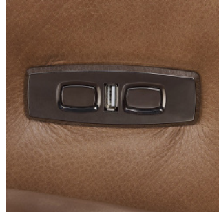
Motion switch and USB port