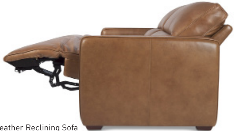
Leather Reclining Sofa