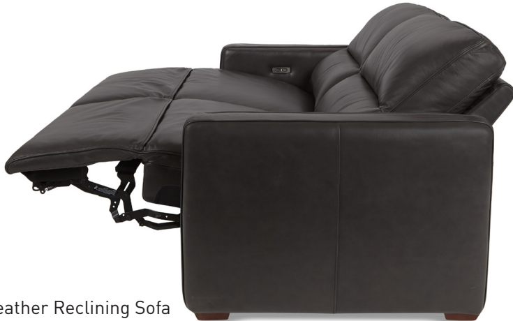
Leather Reclining Sofa